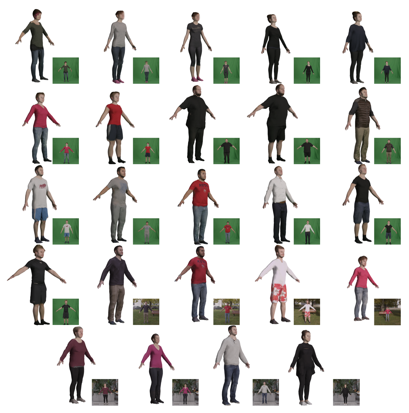
Figure 3. Results on our People-Snapshot dataset. We blurred the faces for the subjects that did not give consent.